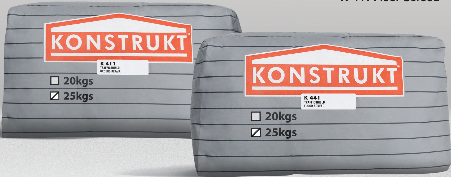
Konstrukt™ Trafficshield™ K-441 Floor Screed