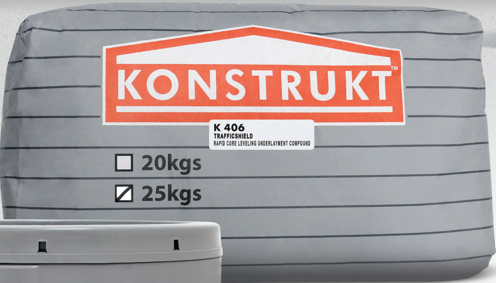
K 406 TRAFFICSHIELD RAPID CURE LEVELING UNDERLAYMENT COMPOUND