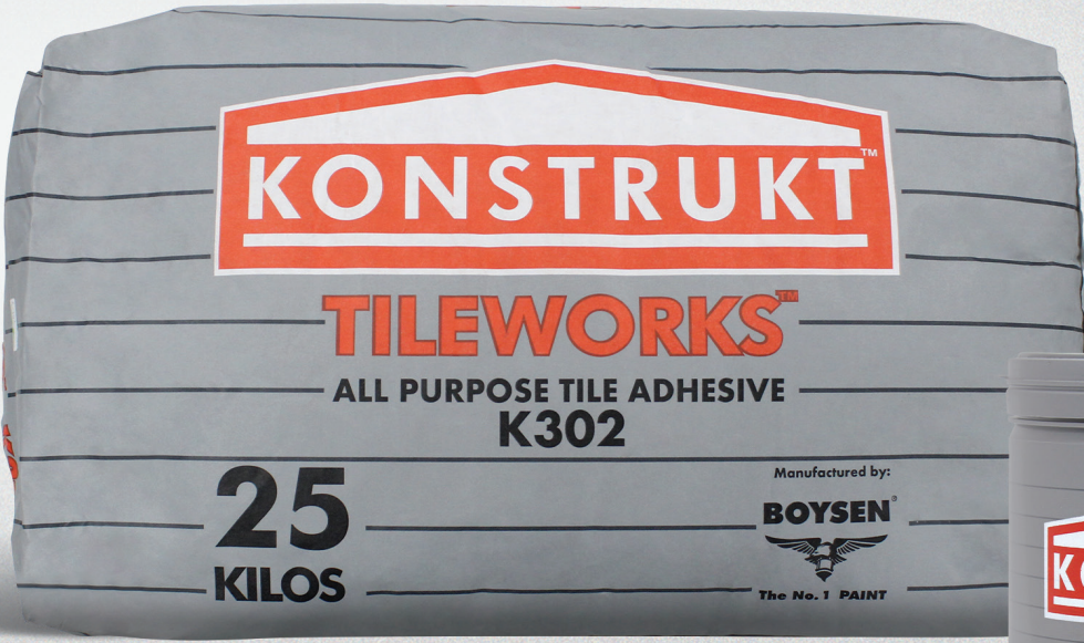
KONSTRUKT TILEWORKS™ ALL PURPOSE TILE ADHESIVE K302