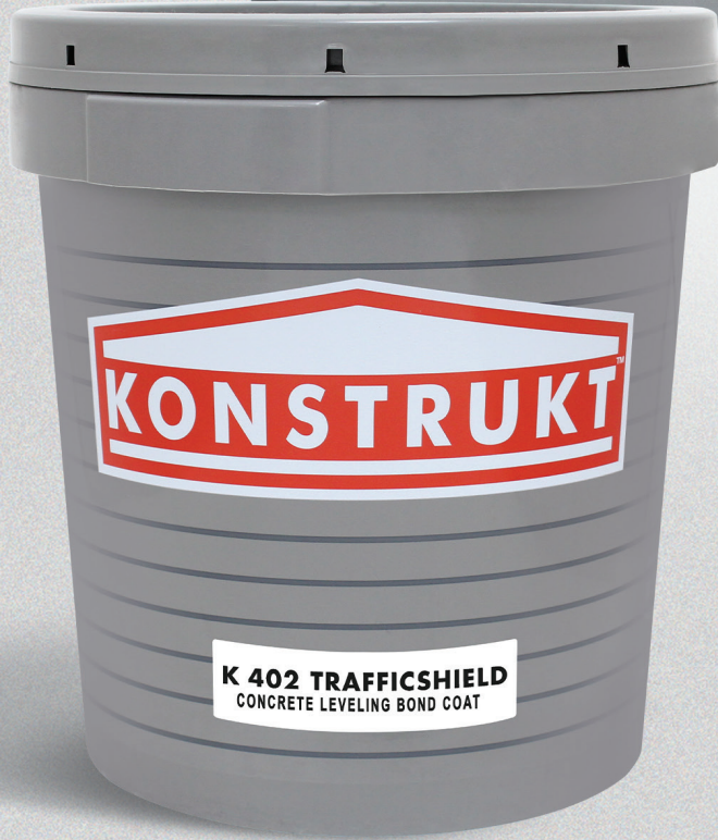
K 402 TRAFFICSHIELD CONCRETE LEVELING BOND COAT