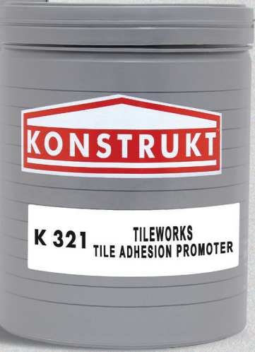
K 321 TILEWORKS TILE ADHESION PROMOTER