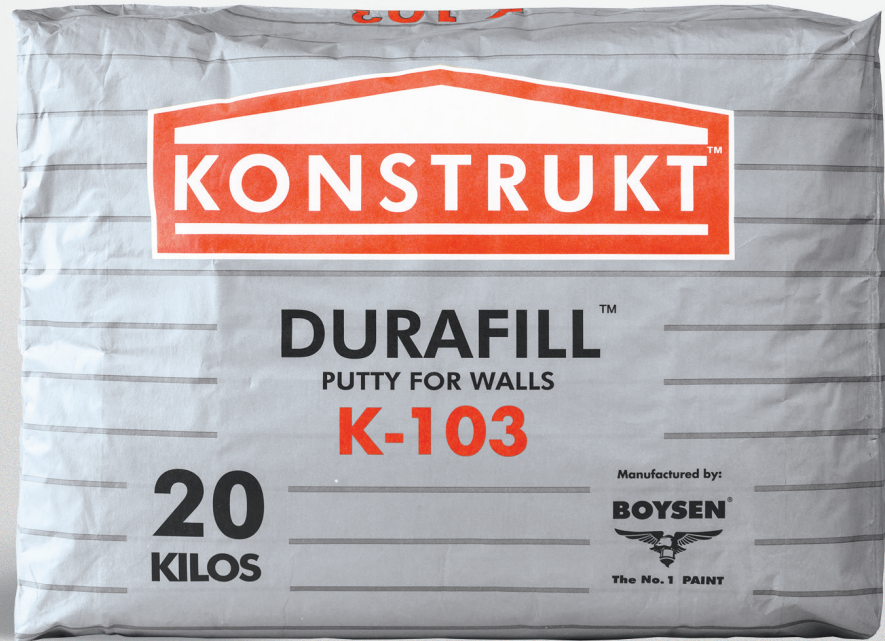
Konstrukt™ Durafill™ K-103 Fast-Setting Gypsum Compound